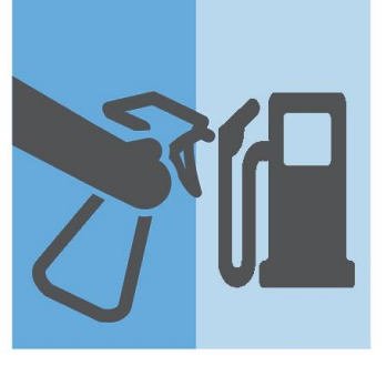
DISINFECT FUEL PUMP HANDLES AND TOUCH SCREENS OR USE A DISPOSABLE TOWEL OR OTHER COVERING. WASH OR SANITIZE HANDS IMMEDIATELY AFTER USE.

To report complaints or apparent violations, complaints against employment services, or for job placement information, please leave a message at the Ohio Department of Job and Family Services farmworker hotline, 1-888-296-7541, and someone will call you back.