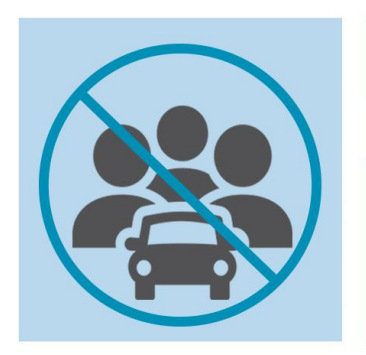
WHEN POSSIBLE, DON'T RIDE IN A VEHICLE WITH MEMBERS OF DIFFERENT WORK CREWS OR HOUSEHOLDS.

For additional information call 1-833-4-ASK-ODH or visit coronavirus.ohio.gov.