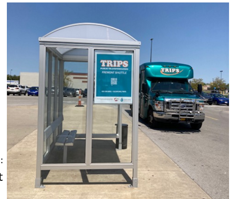
Bus shelter location: Fremont Walmart