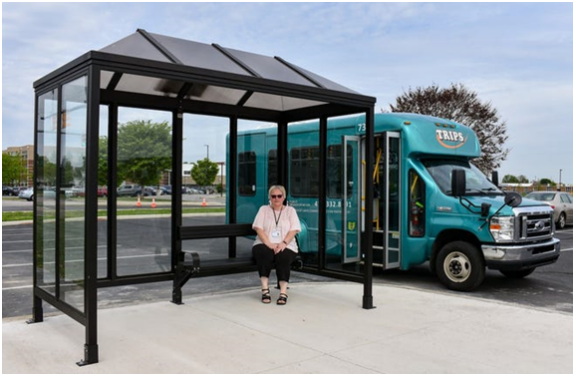
Bus shelter location: Fremont Ross